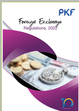
Forex Regulations 2022

Click on the below Publications and updates that you may be interested with