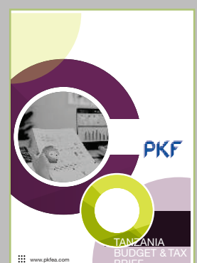
Finance Act Brief 2022-2023