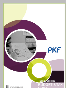
Finance Act Brief 2022-2023