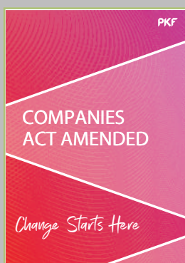
Amendment on the Companies Act, 2022