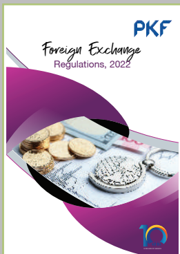
Forex Regulations 2022

Click on the below Publications and updates that you may be interested with