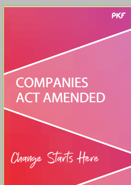
Amendment on the Companies Act, 2022